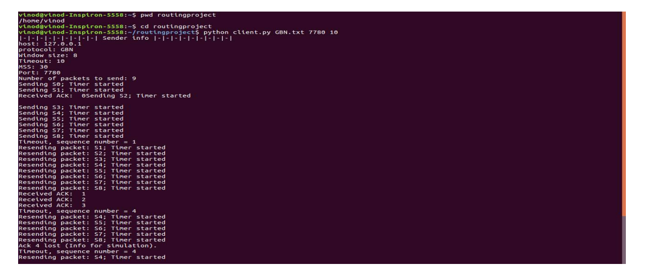
Fig 1 Client.py

> The detection of the clone is done. And the client sends the packets to the server for the acknowledgement.